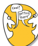
4. Check in

Information and resources for R U OK? Week can be found at http://www.ruok.org.au/