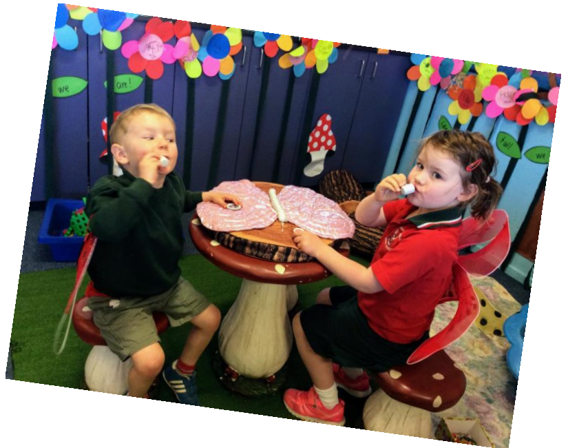
Sharing time with friends in Kindy