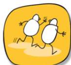
3. Encourage action