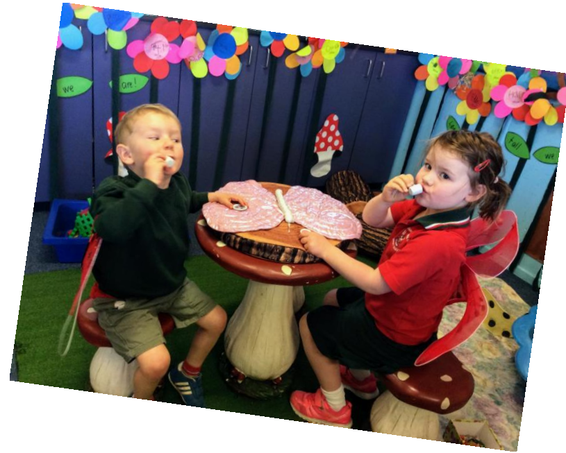
Sharing time with friends in Kindy